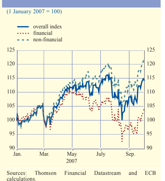
Chart A Sectoral stock prices in the euro area

The underperformance of the financial sector reflects the changes in market participants' perceptions of the credit risk faced by financial institutions (including banks). This reflects the fact that financial institutions have the greatest exposure to those market segments which are at the epicentre of the turmoil, namely asset-backed securities and structured finance in general. These have suffered the most from declines in asset values and the drying up of market liquidity and activity. Market perceptions of the earnings and credit outlook for financial corporations have therefore deteriorated in the face of these difficulties.