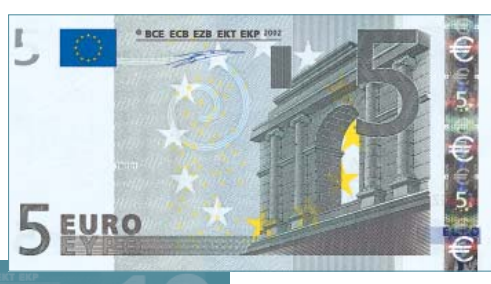
In 2006 all ECB publications will feature a motif taken from the €5 banknote.