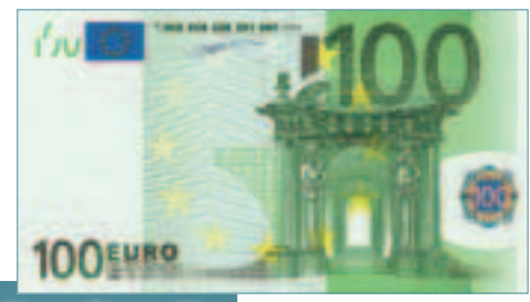
In 2004 all ECB publications will feature a motif taken from the €100 banknote.