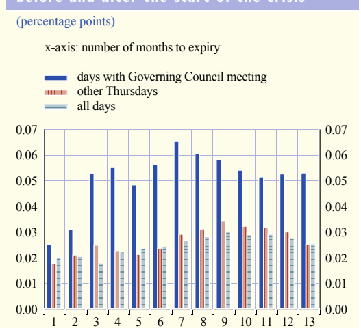
Note: Difference between the mean absolute daily return in the periods from August 2005 to July 2007 and from August 2007 to July 2009.

Difference between the average absolute daily changes in three-month EURIBOR futures before and after the start of the crisis