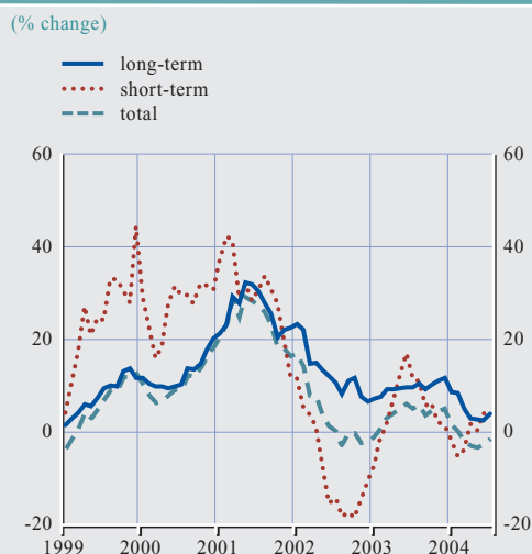
Chart B5.1 Annual growth in debt securities issued by euro area non-financial corporations