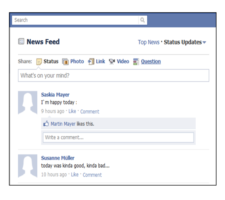
Figure 2: Status Updates in Facebook

Note: This figure illustrates the total number of Facebook users and Google's Search Volume Index (SVI) for the keyword 'Facebook' over the period beginning from December, 2004 through April, 2012. The data come from Google and Facebook.